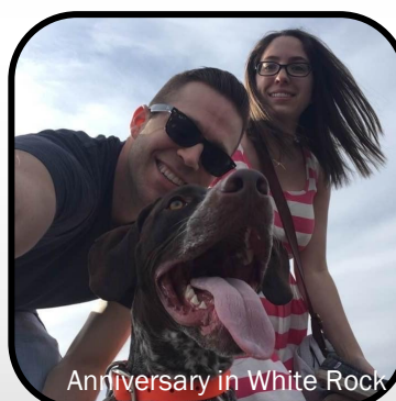
Anniversary in White Rock