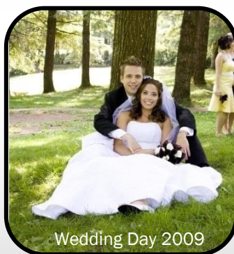
Wedding Day 2009