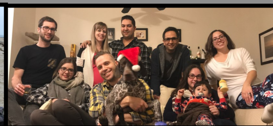
Christmas with friends