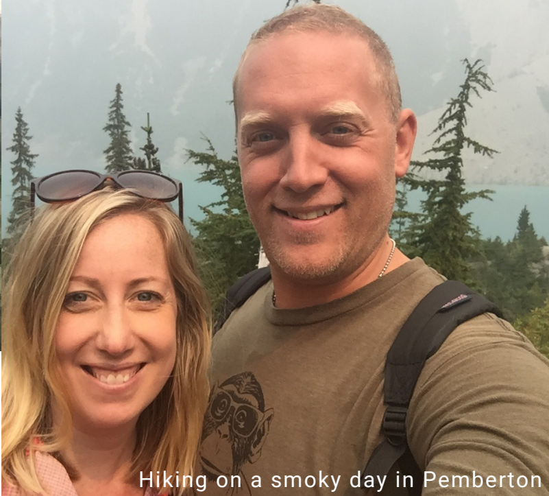
Hiking on a smoky day in Pemberton