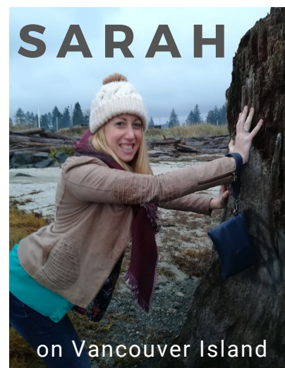
on Vancouver Island