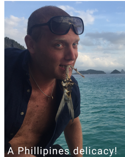
A Phillipines delicacy!