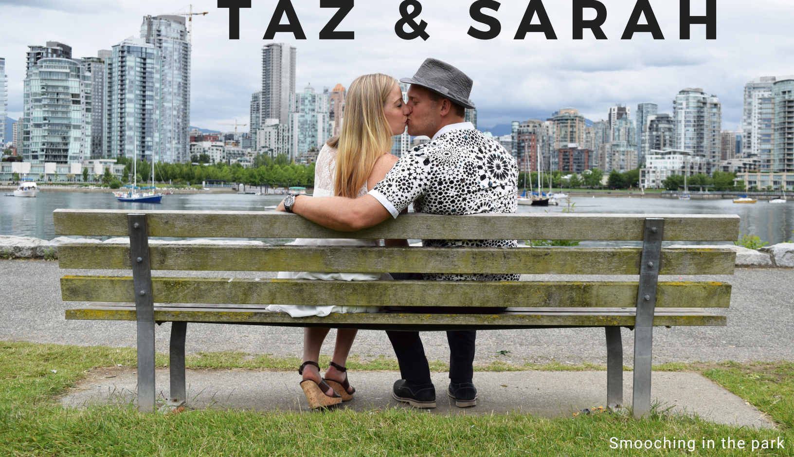
Smooching in the park