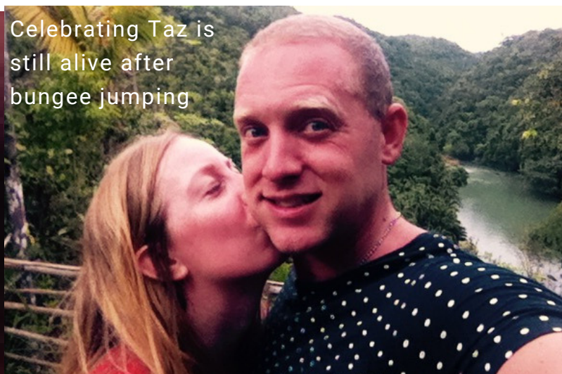
Celebrating Taz is still alive after bungee jumping

We thank you for considering us. If we sound like a good match, we'd love to meet you!