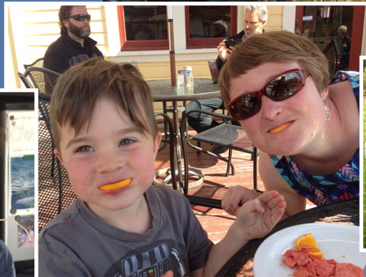
Fun with Friends