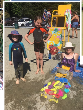
Fun with Friends