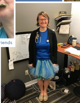
Fun at Work