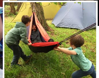
Camping with Friends