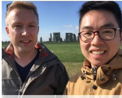
Trip to Stonehenge, UK